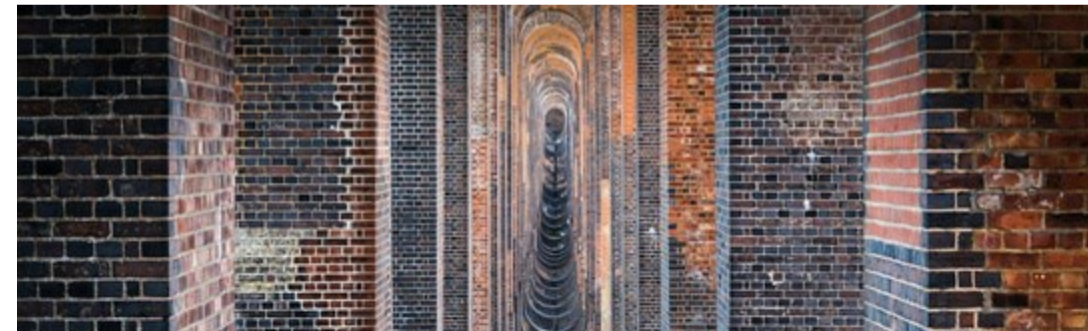
Ouse Valley Viaduct, United Kingdom